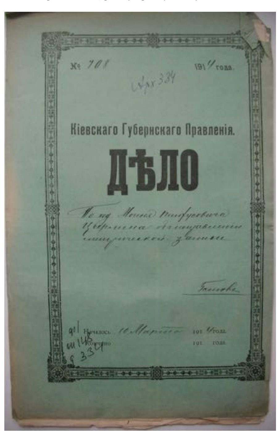
Case C, title

Note: in Russian, Tsyrlin is equivalent to Цырлин (more typical for Moisey's family), and Tsirlin is equivalent to Цирлин (frequently used by other relatives).